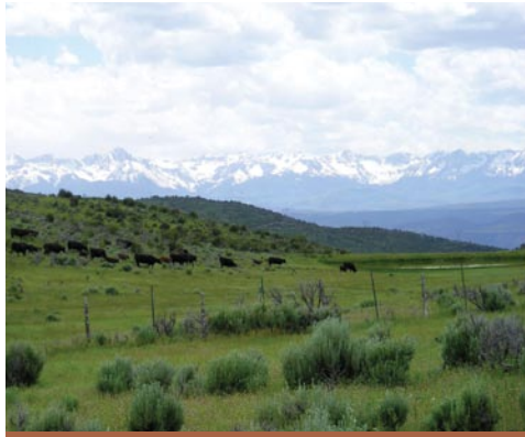
SHINN PARK RANCH

This classic ski-in/out Colorado log home sits on a private one-acre parcel backing up to a large open space belt. The impressive 13,500+ sq. ft. estate features rugged alpine architecture, combined with every modern convenience and the highest levels of finishes. 6 bedrooms, including 3 master suites, a gourmet kitchen, rec room, media room, ski/fitness room, 3 bars, 5 fireplaces, a wine cellar, 4-car garage, caretaker's unit/pilot's quarters and more. Stunning views of the San Sophia range and ski area are enjoyed from inside the residence, as well as from the many decks. Fully furnished. $11,900,000