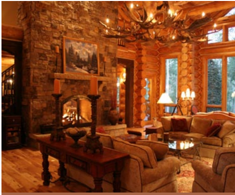
106 HIGHLANDS WAY

This classic ski-in/out Colorado log home sits on a private one-acre parcel backing up to a large open space belt. The impressive 13,500+ sq. ft. estate features rugged alpine architecture, combined with every modern convenience and the highest levels of finishes. 6 bedrooms, including 3 master suites, a gourmet kitchen, rec room, media room, ski/fitness room, 3 bars, 5 fireplaces, a wine cellar, 4-car garage, caretaker's unit/pilot's quarters and more. Stunning views of the San Sophia range and ski area are enjoyed from inside the residence, as well as from the many decks. Fully furnished. $11,900,000